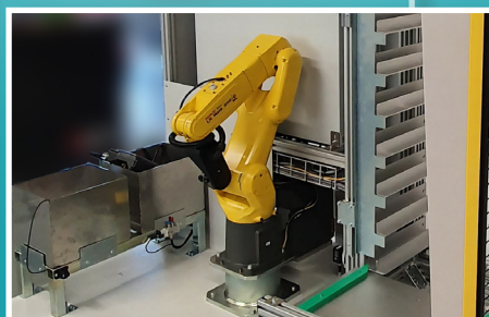
Robot for unloading and feeding