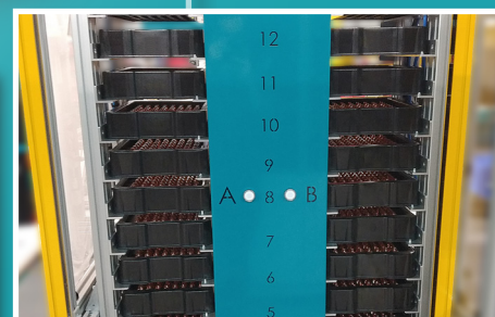
Blister tower with transport system